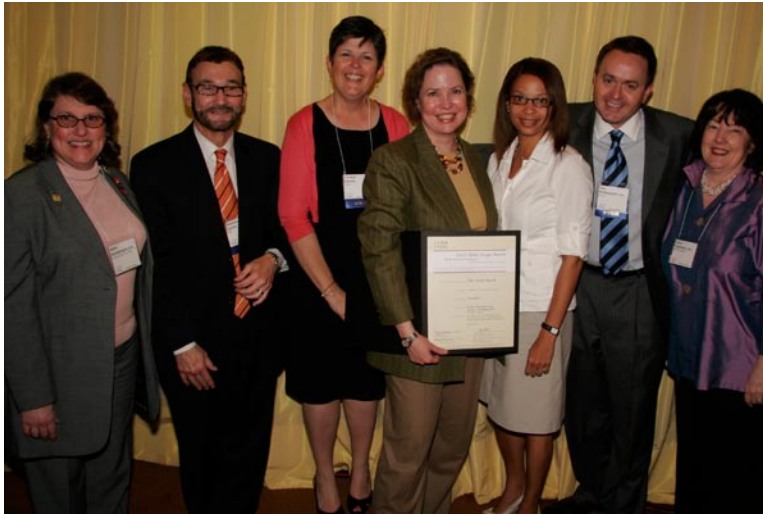
Gensler Gold Award Recipients